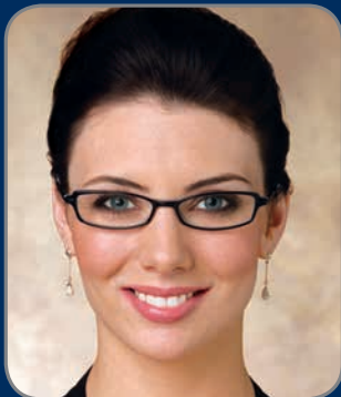
Crizal No-Glare lens

Feel better: fewer headaches and less eye fatigue